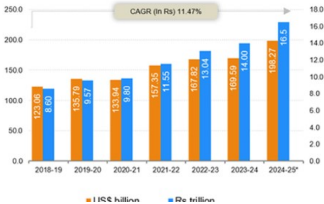
GSDP of Telangana at current prices

Karimnagar. The state has a strong presence in the pharma sector, with several large pharma companies having their manufacturing units in the state.